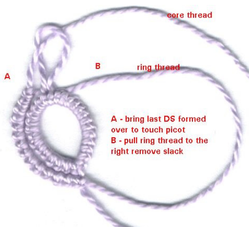
Onion Ring join