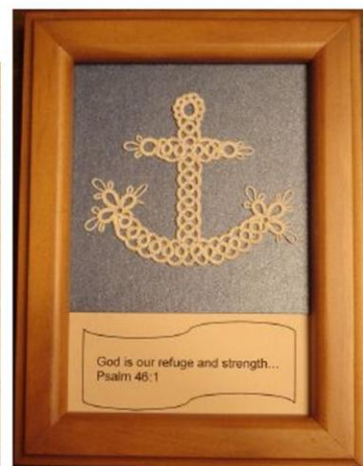
Cream on Blue, with verse