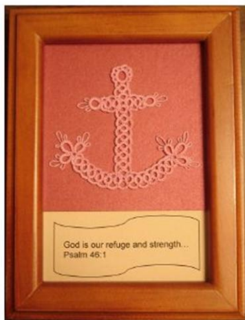
Pink on Burgundy, with verse