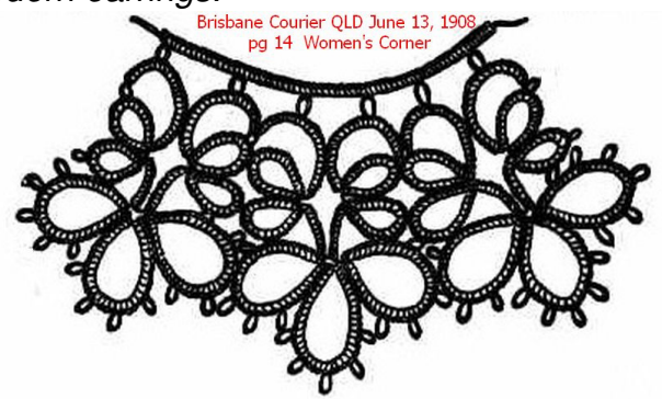
Diagram of pattern from the 1908 Brisbane Courier

This pattern appeared was published on BellaOnline.com in Oct.2014. It inspired one tatter to adapt it for modern earrings.