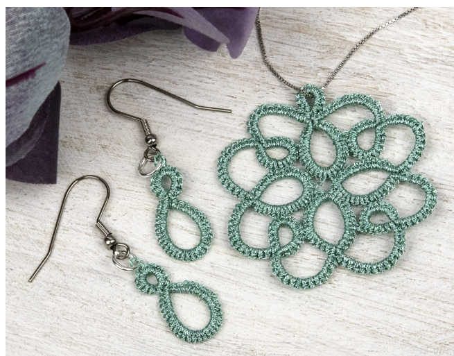
LizMetallic Size 20: #322 Seafoam