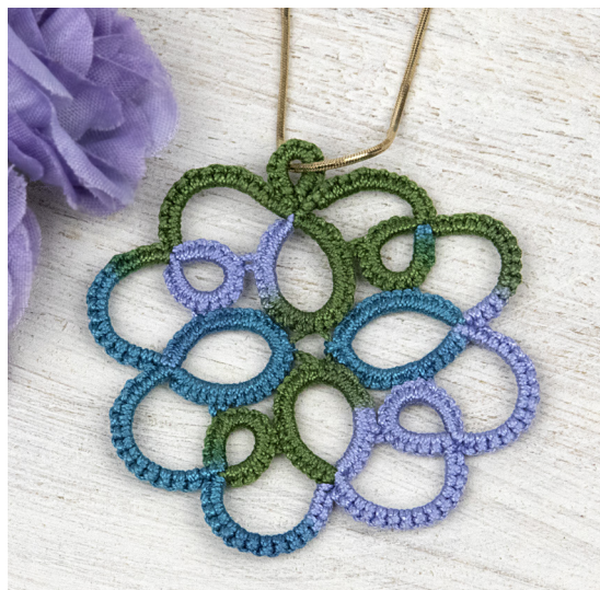
Lizbeth® Size 10: #117 Country Side