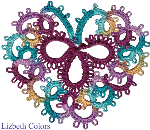
Lizbeth Colors #155 & 644